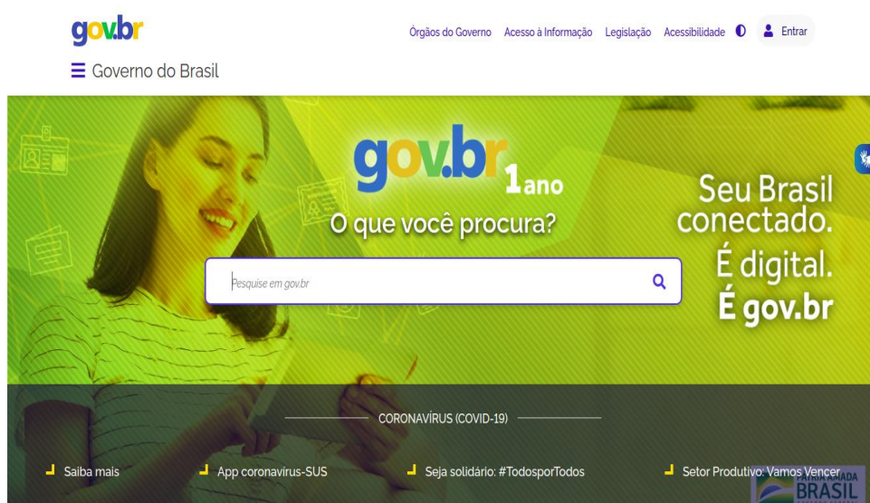
Figure 4 - Home page of Gov.br

The platforms object of this study are: the Secretariat of Digital Government (SGD) "Gov.br", the ABDI "EPIMatch" and the IFCE "FiquenoLar". Gov.br (Figure 4) provides digital identity and digital services to citizens, EPI Match (Figure 5) facilitates the connection among demand and supply of personal protective equipment (PPE, which's acronym in Portuguese is EPI) and FiquenoLar (Figure 6) displays information about the local business to consumers that were advised to shelter in place in the context of the pandemic.