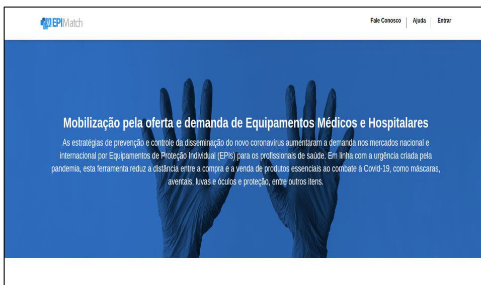
Figure 5 - Home page of EPI Match