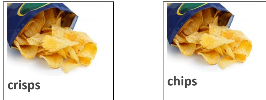
Figure 3. Memory game images.

Through this game, students can improve vocabulary and discover different possibilities of saying the same lexical item according to the region English native and non-native speakers live in. With this activity, it is possible to raise the awareness that lexical choices are influenced by language use along with age and geographic location. In addition, it would be very valuable to ask students to research about lexical variation in terms of differences in meaning in order to present in class. For example, the word vest , in the United States (US), means “a piece of clothing that covers the upper body but not the arms and usually has buttons down the front, worn over a shirt”, while, in the United Kingdom (UK), the same word signifies “a piece of underwear worn under a shirt, etc. next to the skin”. By means of this activity, students are motivated to engage in their own process of language learning and became aware of this kind variation in meaning. As a result, communication problems and misunderstandings may be avoided. This is a nice illustration of how noteworthy linguistic variation teaching is useful for language learning.