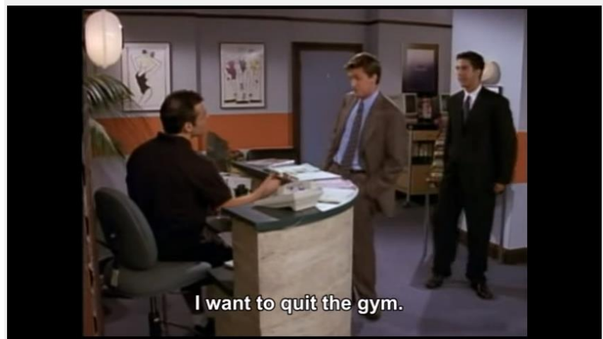
Figure 2. Video “ Friends: how to quit a gym membership ”.

While they are watching the video, the students should mark a tick (✓) in the form (see Table 2), which represents the characters’ pronunciation in relation to the underlined sounds and words: