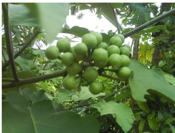
Figure 1. Green fruits of jurubeba ( Solanum paniculatum )

The plant known as Jurubeba ( Solanum paniculatum ) is shrubby, perennial, with thorny stems and branches, sinuous leaves and may be reproduced by seed, and vegetatively by rhizomes. It is a frequent plant in semi-sandy and acidic soils, the shrub being a small tree with short curved thorns. The inflorescence appears at the back of the branches, which concentrate many leaves located close together, rising long stalks with up to 15 cm in length, as presented in Figure 1.